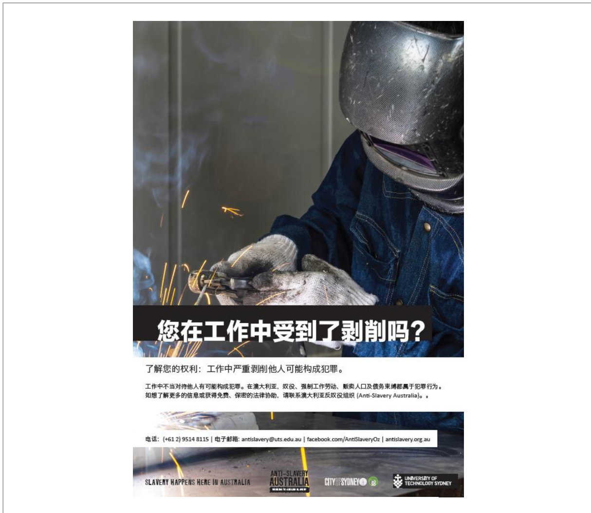
Figure 1: “Being exploited at work?” flyer produced in Simplified Chinese.

Anti-Slavery Australia has produced a number of multi-lingual resources related to exploitative practices including forced labour and forced marriage.